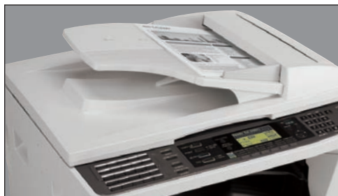
MX-M200D shown with standard 40-sheet Reversing Single Pass Feeder.