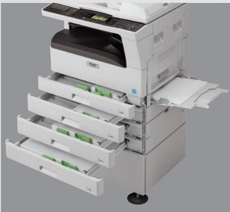
MX-M200D shown with optional 2 x 500-sheet paper feed unit.