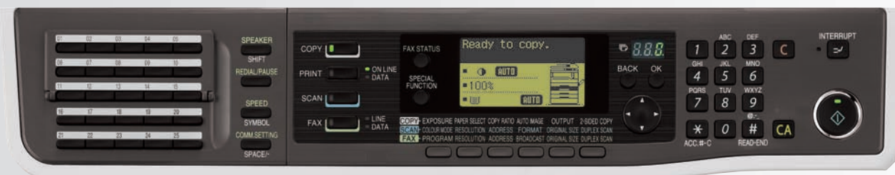
MX-M200D Control Panel with optional Fax Kit.

Maximize capabilities of your MX-M200D with optional full-color network scanning and feature rich network printing! With simple plug-and-play operation, the optional full-featured Network Expansion Kit offers PCL6 network printing, walk-up scanning, web-based device management and more. With Sharp's easy-to-use utilities and driver software, the versatile MX-M200D can easily integrate into an existing network environment.